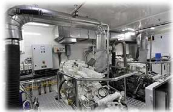
Machinery & Sails

REGINA is designed as a high performance, ocean going vessel, MCA compliant and super-equipped to meet the needs of a demanding charterer. For security reasons there is bilges high level, temperatures, pressures, machinery faults, burned out lamps, open portholes, etc. alarms on PLC monitoring computer system. REGINA is a sailing schooner with two masts and a strong standing rigging calculated by Christopher John Mitchell (AES Ltd). The steel hull is built both on vertical and longitudinal frames to ensure stiffness of the yacht under strong sea conditions.