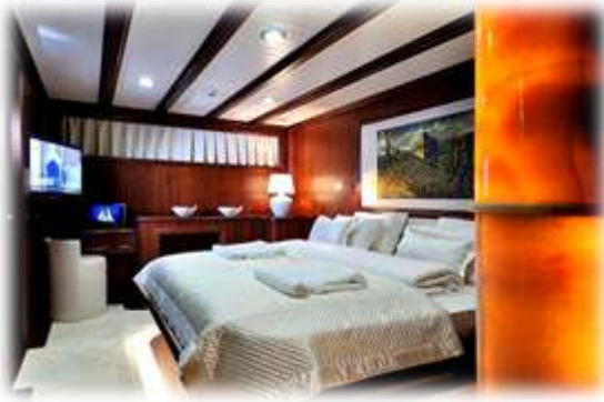
Aft Master Stateroom