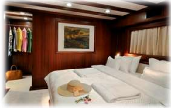
Double Guest Cabin

One twin and three double guest cabins are located on starboard and port sides. They are as comfortable as owner staterooms. All of them are fitted with Satellite TV, DVD and music system. Apart from air conditioning there is fresh air ventilation system installed in all enclosed spaces.