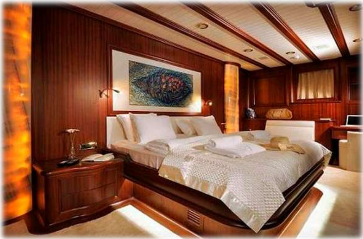
Bow Master Stateroom

The 2nd Master Stateroom is located on the front and a little bit smaller than the first. It also features a separate dressing room and onyx details.